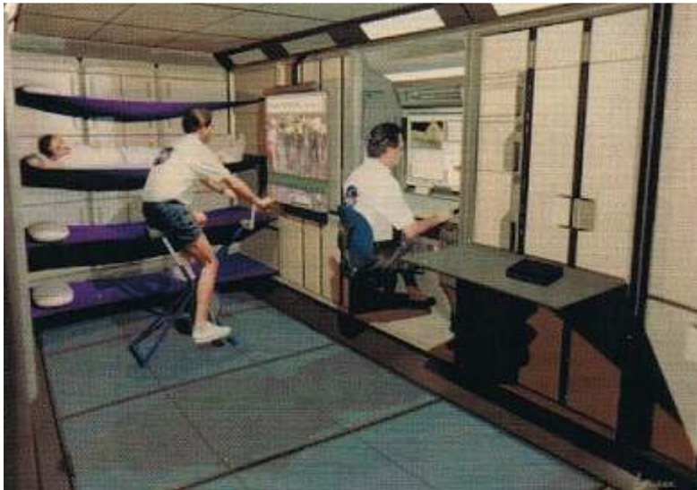
Habitat module interior