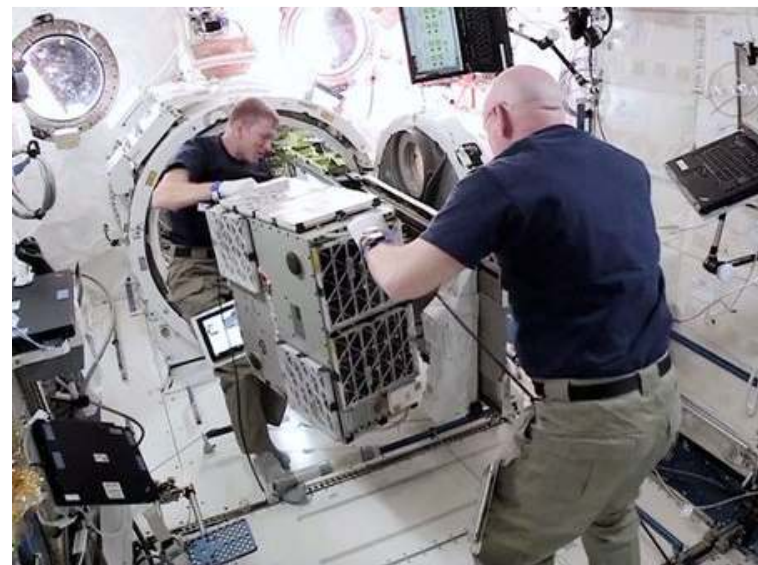
Astronauts Kelly and Peake move the Aggiesat-4/Bevo-2 deployer into the Kibo module

On 29 January 2016 astronauts on board of ISS deployed the AggieSat-4 satellite through the airlock of the Kibo module, using the robotic arm.