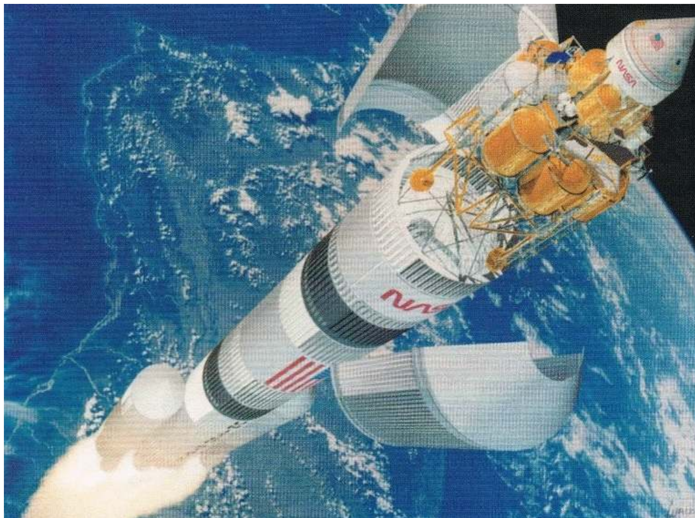
First Lunar Outpost