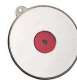
Strobe Flash Lamp – Compass – Light stick – Alu blanket – Distress mirror