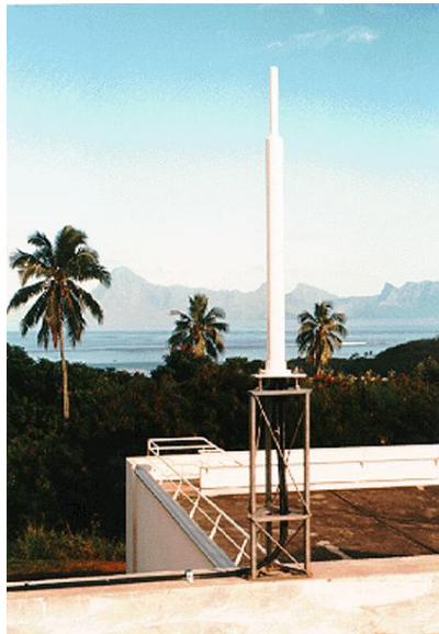
Figure. 2 – DORIS beacon antenna in Papeete

The beacons transmit the radiofrequency DORIS signals, composed of two modulated carriers. Two frequencies are used : 2.03625 GHz for precise measurement of the Doppler effect, and 401.25 MHz for ionospheric effect compensation.