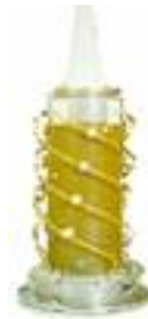
Figure 3 - DORIS DGXX receiver and the on-board antenna

DGXX generation receivers also perform accurate and complete phase, delta-phase and time-tagging measurements.